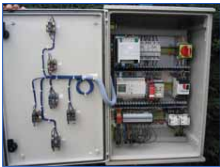
Electrical control panel

Four HDPE blocks fixed to the rake holder guarantee the perfect and parallel movement of the rake inside the guiding profiles.