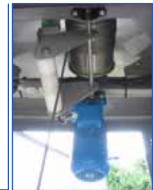
Cable driven system