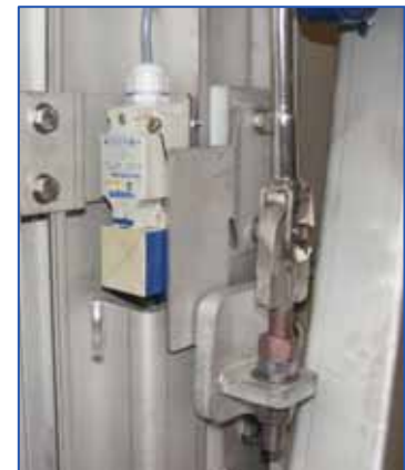
Position limit switches

The rake is fixed to the holder by means of self lubricating rings. The sides of the rake are made of 20 mm thick stainless steel plates to use the weight of the rake to help the downwards movement.